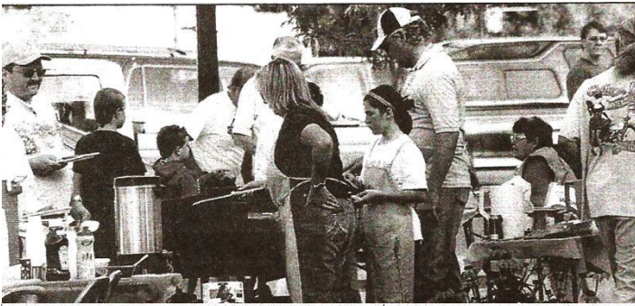
Early Bird Breakfast Saturday morning

Thanks to the Park City Lions for the Early Bird Breakfast on Main Street...just before the parade and during the Fun Run!